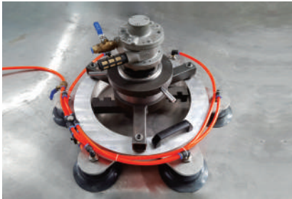
快速补挖 Disc patching