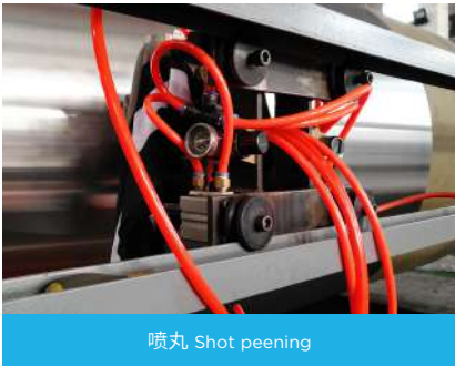
喷丸 Shot peening