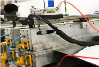
横向焊接 Cross welding