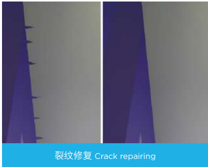
裂纹修复 Crack repairing