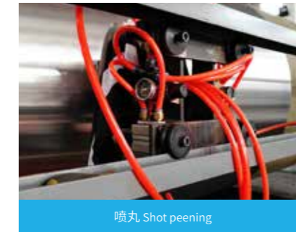
喷丸 Shot peening