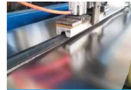
粘贴V形胶条 V-rope bonding