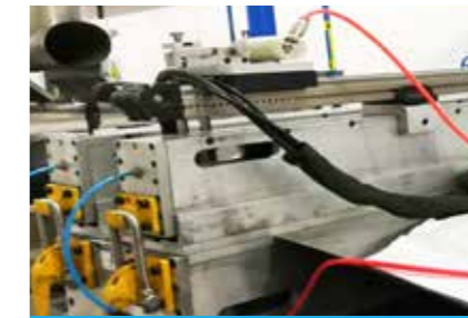
横向焊接 Cross welding