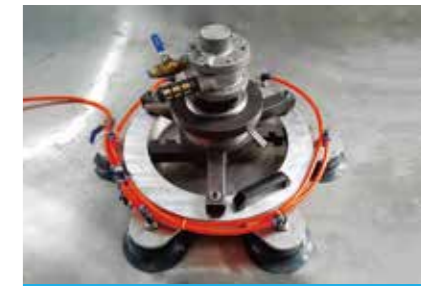
快速补挖 Disc patching